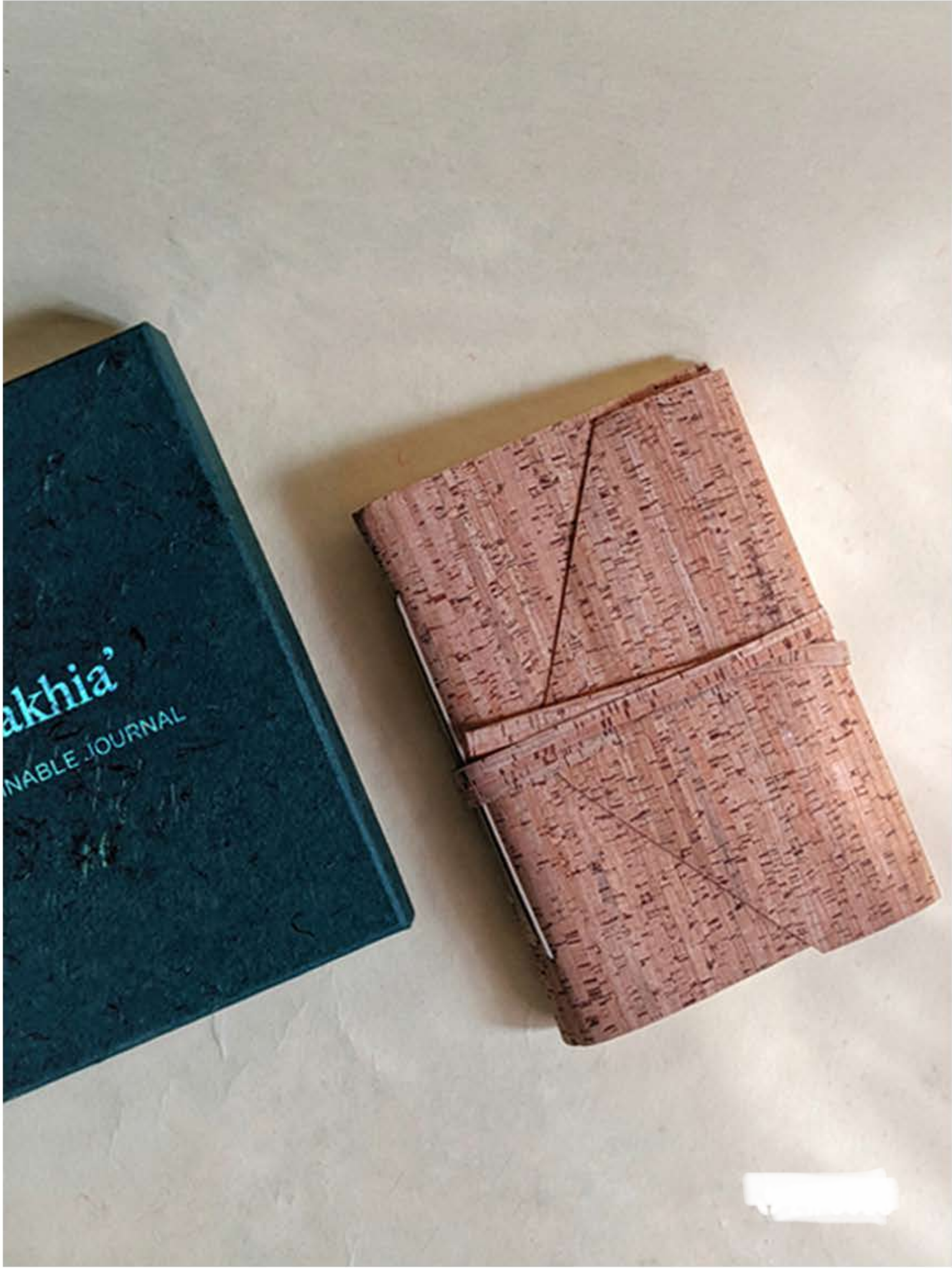
Figure 1: Two journals, one dark green and one reddish-brown cork, illustrating sustainable materials.